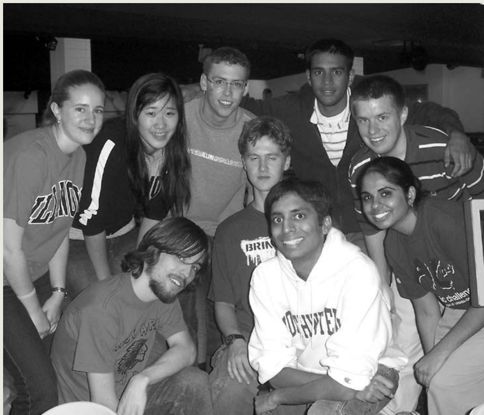
Bowling at the Union