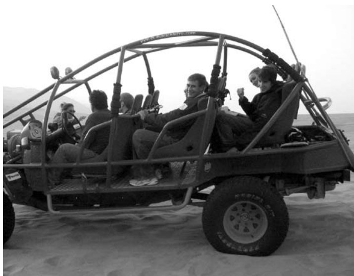
Buggy-riding on the Nasca dunes, Peru, Summer 2005